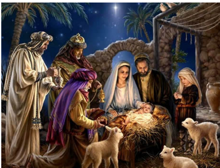
The Epiphany of the Lord